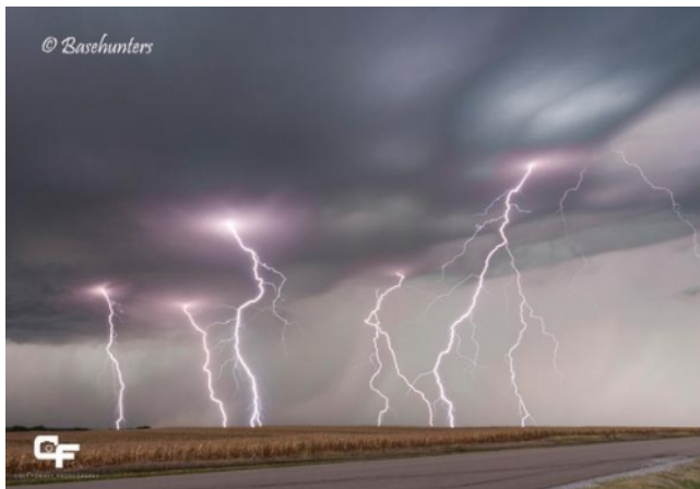
Four photos were stacked together to make this incredible image of lightning over Marysville, Kan., on Sept. 9, 2014.

Now, a new study finds that lightning strikes will become even more frequent as the planet warms, at least in the continental U.S.